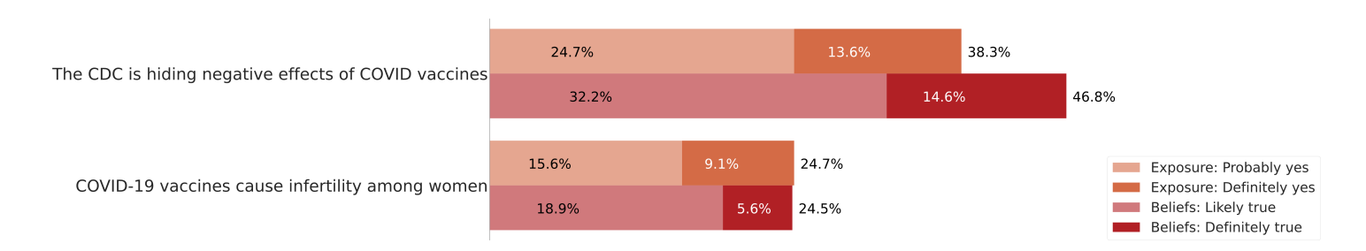
Figure 1 Exposure to and belief in vaccine misinformation